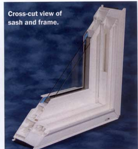
Cross-cut view of sash and frame.

Technologically-driven processes can ensure precision sash and mainframe fit to guarantee full contact weather-stripping and a professional installation that is perfectly