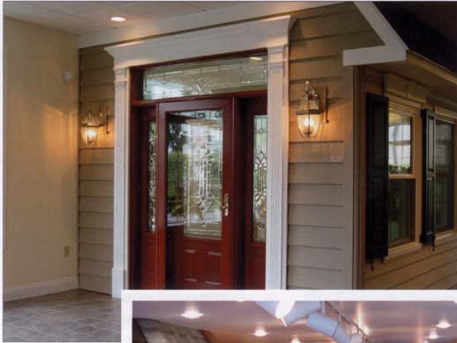
Exciting displays of windows and doors in Lancaster and Ephrata showrooms.