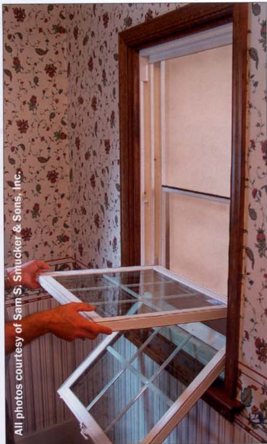
Windows tilt in for easy cleaning.

...not all replacement windows are the same.